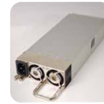
Optional N+1 redundant PSU