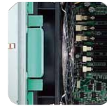
Easy-swap 120mm rear fan