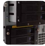
Removable HDD cage for hot-swap or non hot-swap