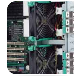
Hot-swap fan (SR108)